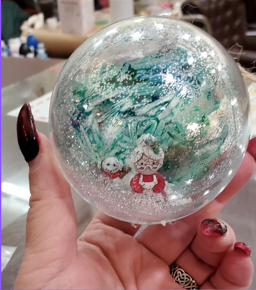
Christmas Snow globe