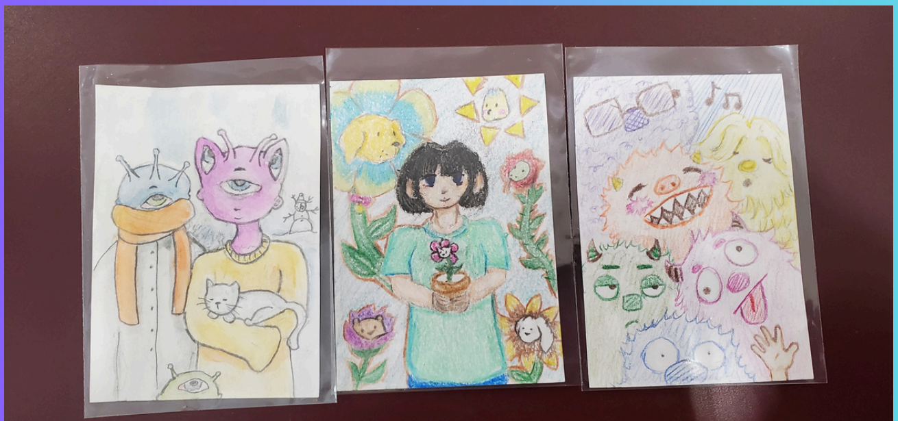
Art Trading Cards